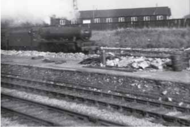
Photo taken during the demolition of Farington Station in 1960. Jubilee Class No. 45663 'Jervis'

In the days when television was the preserve of the rich and snobs only, lurked the honourable (nay only) pastime of trainspotting! Days when electrics and diesels were almost unheard of and very rarely seen in the railway hotbed of Lostock Hall. A five minute walk in almost any direction from the village centre would bring you into railway territory. It was like a 'Bermuda Triangle' of railway tracks inhabited by huge iron horses of all shapes, sizes and colours. These beasts carried nicknames like Mickeys, Jubs, Pats, Scots, Semis, Brits, Lizzies, Tanks, etc., relating to the many classes of locomotive which plied their trade on the London Midland and Scottish Railway. A gang of us, 8-10 years olds, had a huge variety of vantage points around the 'Triangle' from which to spot these memorable monsters of steam.