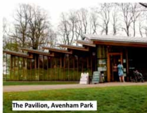
The Pavilion, Avenham Park

All talks begin at 7.30pm in the Avenham Park Pavilion , on alternate Wednesday evenings: